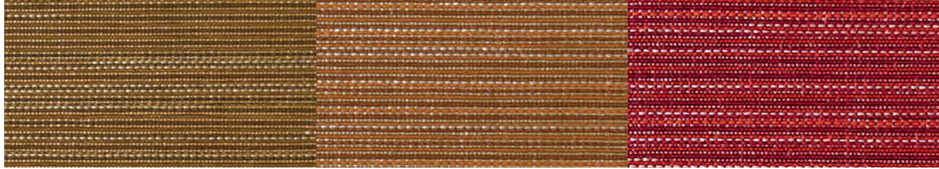
Saddle Brown 135-08