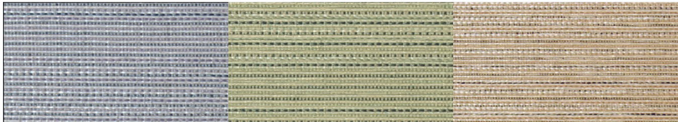
Beach Glass 135-10