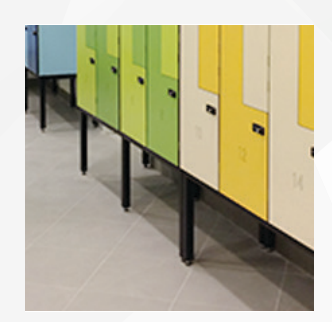
Steel Based (Standard)