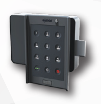
Digital touch lock