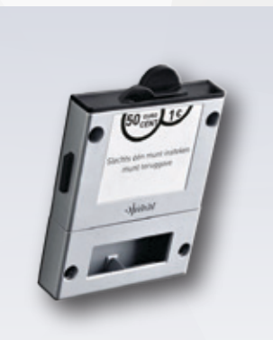
Coin operated lock