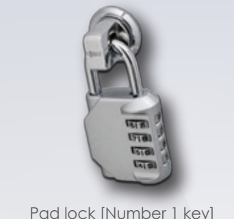
Pad lock [Number 1 key]