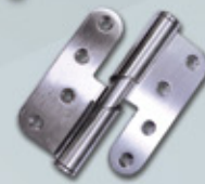
SELF RISING HINGE